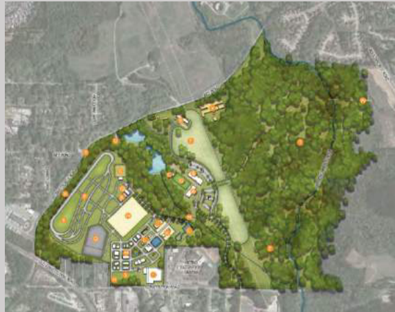
(U) The planned public safety training facility will sit on a wooded area in southeast Atlanta.

(U//FOUO) In September 2021, the city of Atlanta approved plans to build a $90 million public safety training center in unincorporated Dekalb County, along Atlanta's southeastern edge, according to media reporting. The planned facility sits on a 300-acre parcel of mostly wooded public land now considered part of the South River Forest, one of the largest forested areas in the Atlanta metro area. Some AVEs and AREVEs have repeatedly staged acts of violent obstruction against law enforcement and construction workers entering the site, including throwing rocks and improvised incendiary devices at or around officers and vehicles, slashing tires, and setting a vehicle on fire, according to media reporting.